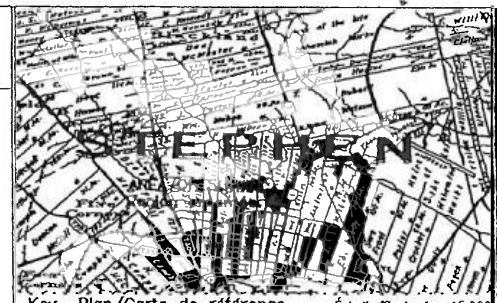
Key Plan/ Carte de référence Echelle/Scale 1 : 15,000

Registration Data/Information d'enregistrement